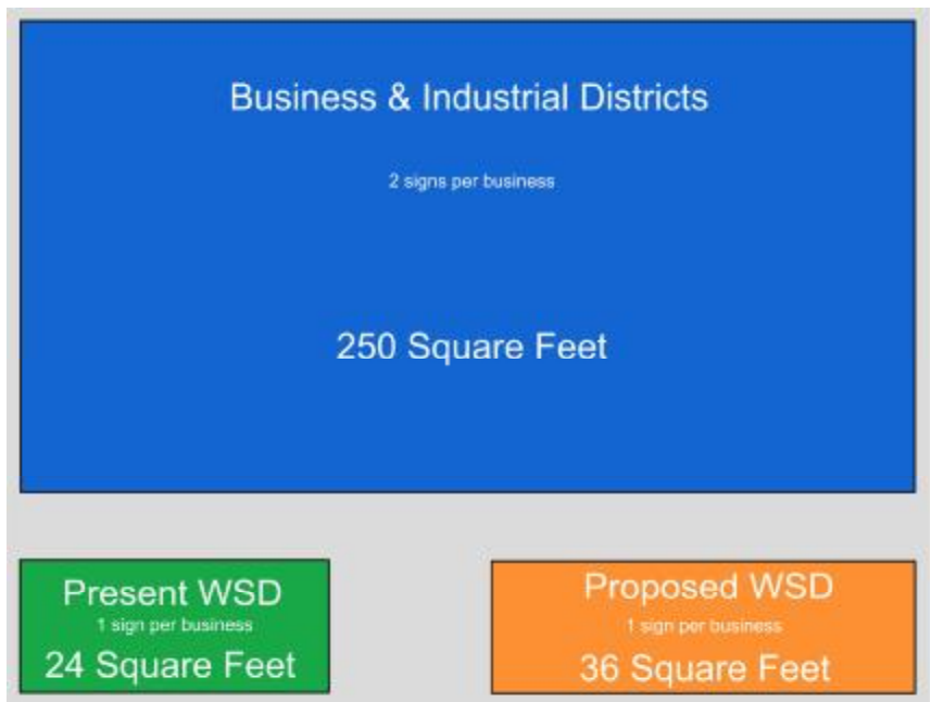
Maximum business signage area

Allow a modest increase in sign size in Waikiki and greater flexibility in the placement and design of signs, but only through a design review process to assure that the aesthetic quality of Waikiki will be preserved or improved.