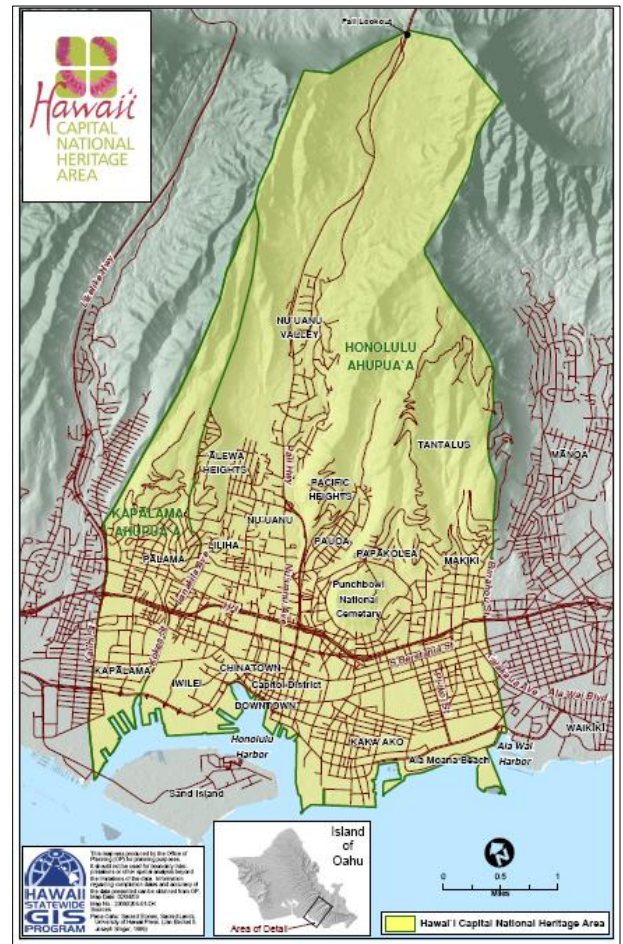
Map of proposed NHA

National Heritage Areas, a program of the National Park Service, allow residents, government agencies, nonprofit groups and private partners to collaboratively plan and implement programs and projects that recognize, preserve, and celebrate America's unique and important stories. Once National Heritage Area designation by the U.S. Congress is achieved, the National Park Service and other federal agencies provide marketing, technical assistance, and federal funding to support preservation, promotion, education, visitor enhancements, and other heritage, cultural tourism, and economic development activities. There are currently forty designated National Heritage Areas throughout the U.S. (For more information visit: www.nps.gov/history/heritageareas ).