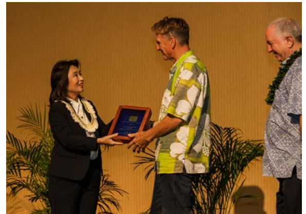
Wayfinder Waikīkī received the Hāna Nui Award.