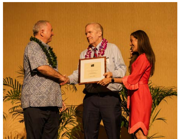
Honolulu Prosecuting Attorney Steven Alm recognized for his distinguished leadership.

After a little over a year, much has been accomplished. Overall crime stats have shown a marked improvement from the first half of 2022, before Waikīkī Safe and Sound, versus the first half of 2023 with all indicators down at least double digits. Over 150 chronic offenders have had geographic restrictions imposed keeping them out of Waikīkī. Kuhio Beach Park improvements have cleaned up major trouble spots and eye sores, including a major rest room renovation. Surveillance cameras have been brought back online. Beach closures have moved up to midnight from 2:00 AM. The total number of homeless is down 43% to 143 individuals in May 2023 from 251 in September 2022.